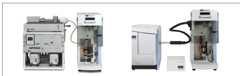
Figure 1. Pyris 1 TGA is shown interfaced to a HPR-20 MS (left) and a Clarus 600 MS (right).

All of the TGA systems supplied by PerkinElmer (Pyris™ 1 TGA, STA 6000 and TGA 4000) can be easily interfaced to MS systems. PerkinElmer can supply systems with either the PerkinElmer Clarus® MS or with a Hiden Analytical MS. In this study, a Pyris 1 TGA interfaced to a Hiden Analytical HPR-20 MS was used.